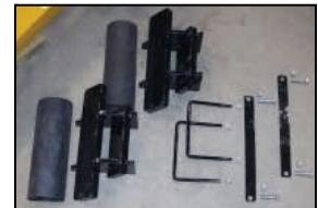
“L” Shaped Forged Forks Kit