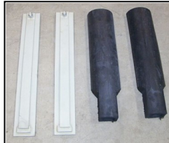
Standard Bumpers Std. Base Brackets Std. Rubber Pads