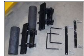
Adjustable Kit AJ Brackets Rocker Pads (Bolt hardware incl.)