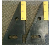
Super Bumpers Kit Super Bumper Brackets Super Bumper* Pads *Patent US 10,364,135 B1