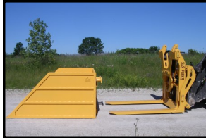
Fast Slide In & Lock