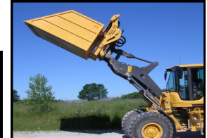
Lift, Move & Dump